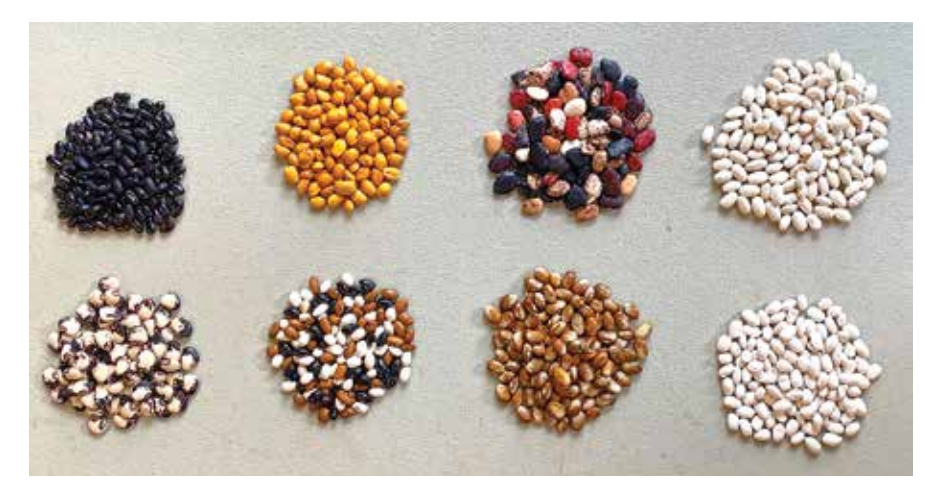
Heirloom bean seeds yield a variety of colors as well as tastes and textures.

When the center opened, its main goal was to demonstrate to regional farmers that they have viable options to off-farm jobs when they diversify and utilize the whole farm, including woodlots. That way, regional products can compete with large-scale farms on the basis of quality.